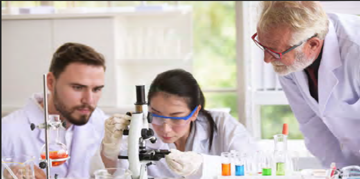
Science has been studying coronaviruses since the 1960s. 10

There have been over 7000 studies dating back to 1968 regarding antivirals and Coronaviruses. 11 COVID-19 is said to be a new or “novel” Coronavirus. Whatever may be said about coronaviruses, they are not entirely unfamiliar to science.