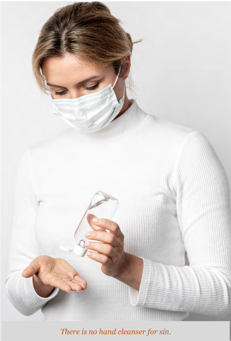
There is no hand cleanser for sin.

The principle of sin operating in human nature has triggered many terrible negative events and disrupted the lives of individuals, families and whole societies. The selfishness at the foundation of sin has not only threatened and caused the loss of property, financial and physical resources and the well-being of everyone in the global human family. Transgression of mental, physical and moral laws of God has resulted in social, national and global intolerable suffering.